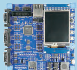
MCBSTM32C Evaluation Board www.keil.com/mcbstm32c