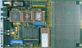
MCBx51 Evaluation Board