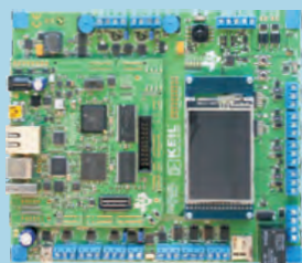
MCBTMS570 Development Kit www.keil.com/mcbtms570