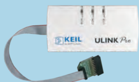
ULINKpro Debug Adapter www.keil.com/ulinkpro