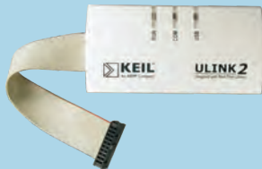
ULINK2 USB Debug Adapter