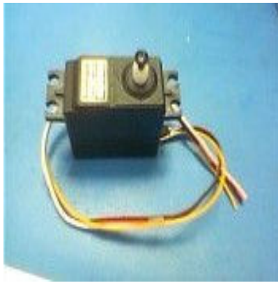
Figure 8. Completed servo. Here is a simple circuit you can use to drive the wires using 1 PWM signal and 1 Direction signal.