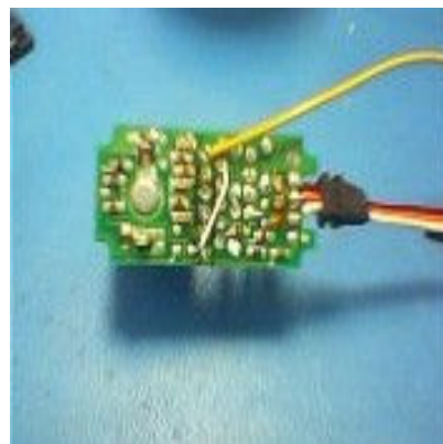
Figure 7. Board after wires are connected. Now just reassemble everything and you are done. Just put 5V and Gnd on the red and black wires, then either pull the white wire high to go one direction, or pull the other wire high to go the other direction. Do not pull them both high at the same time.