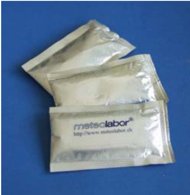
Standard Water Bags

The Waterbags are used to heat the radiosonde during regular radiosonde flight.