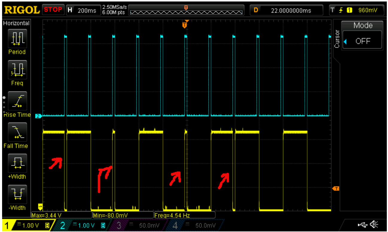
Illustration 3: Wrong generated Interrups, generated not at falling edges. Blue: Interrupt input, Yellow: LED output

In the test a clean signal, coming directly out of a waveform generator was connected to the interrupt input. The rise-time of the pulse was set to 2ms. The figure below shows the wrongly generated interrupts at the rising edge (interrupt was configured to "FALLING").