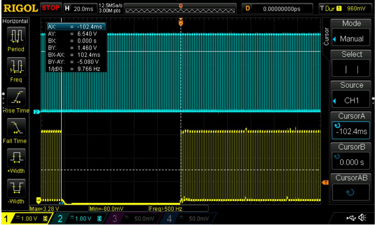
Illustration 1: Measured run-time of the ESP8266WiFiMult::run() function (blue channel Interrupt input, yellow channel LED output)