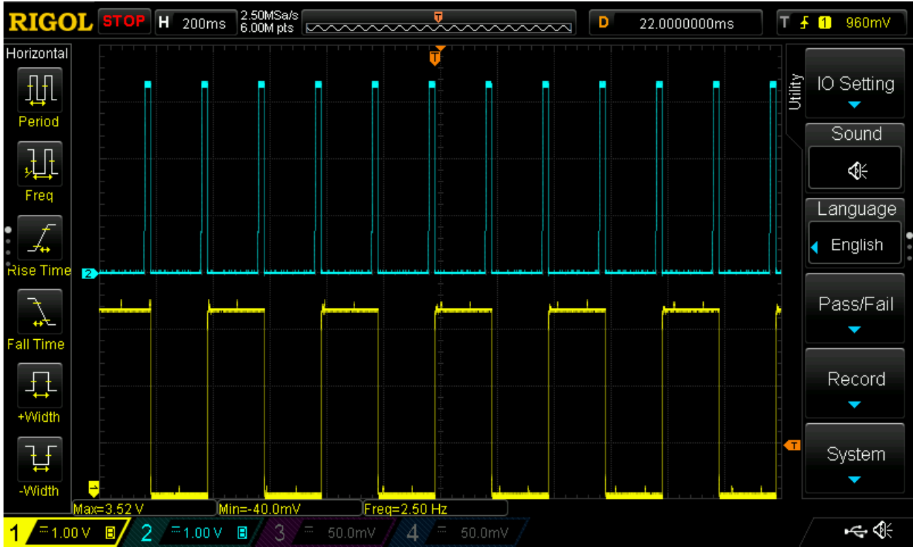
Illustration 4: Finally Interrupts are generated as expected. (blue: interrupt input, yellow: LED output)

A small delay before reading the digital input is required. A delay of 50x NOP's (means 600ns) was already sufficient in this test-setup. In the real project it might be necessary to increase this delay due to noise, different rise-times and rising edge styles.