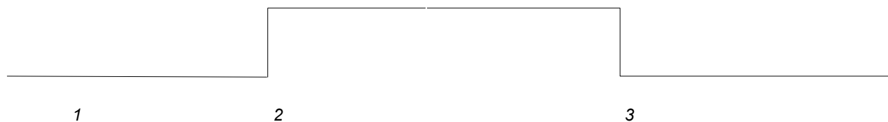
Figure 8.1: State Change of Single Connection

State 1: There is no connection has been established.