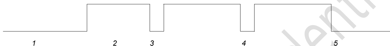
Figure 8.2: State Change of Multiple Connections

State 1: There is no connection has been established.