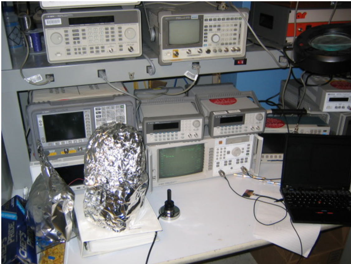
A network analyser (Agilent 8714ET) and a directional antenna measured and plotted the signals. See Figure 2.

Because of the cost of the equipment (about $250,000), and the limited time for which we had access to these devices, the subjects and experimenters performed a few dry runs before the actual experiment (see Figure 3).