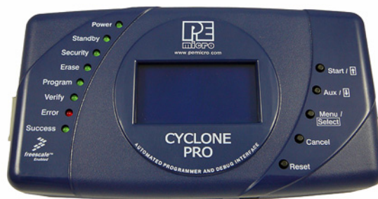
P&E's Cyclone PRO

The USB BDM MULTILINK is intended for development and is not designed to accommodate the demands of production programming. However, P&E's Cyclone programmers are specifically engineered to withstand the rigors of a production environment and will provide a seamless transition from the USB BDM MULTILINK. More information is available at: http://www.pemicro.com/cyclone